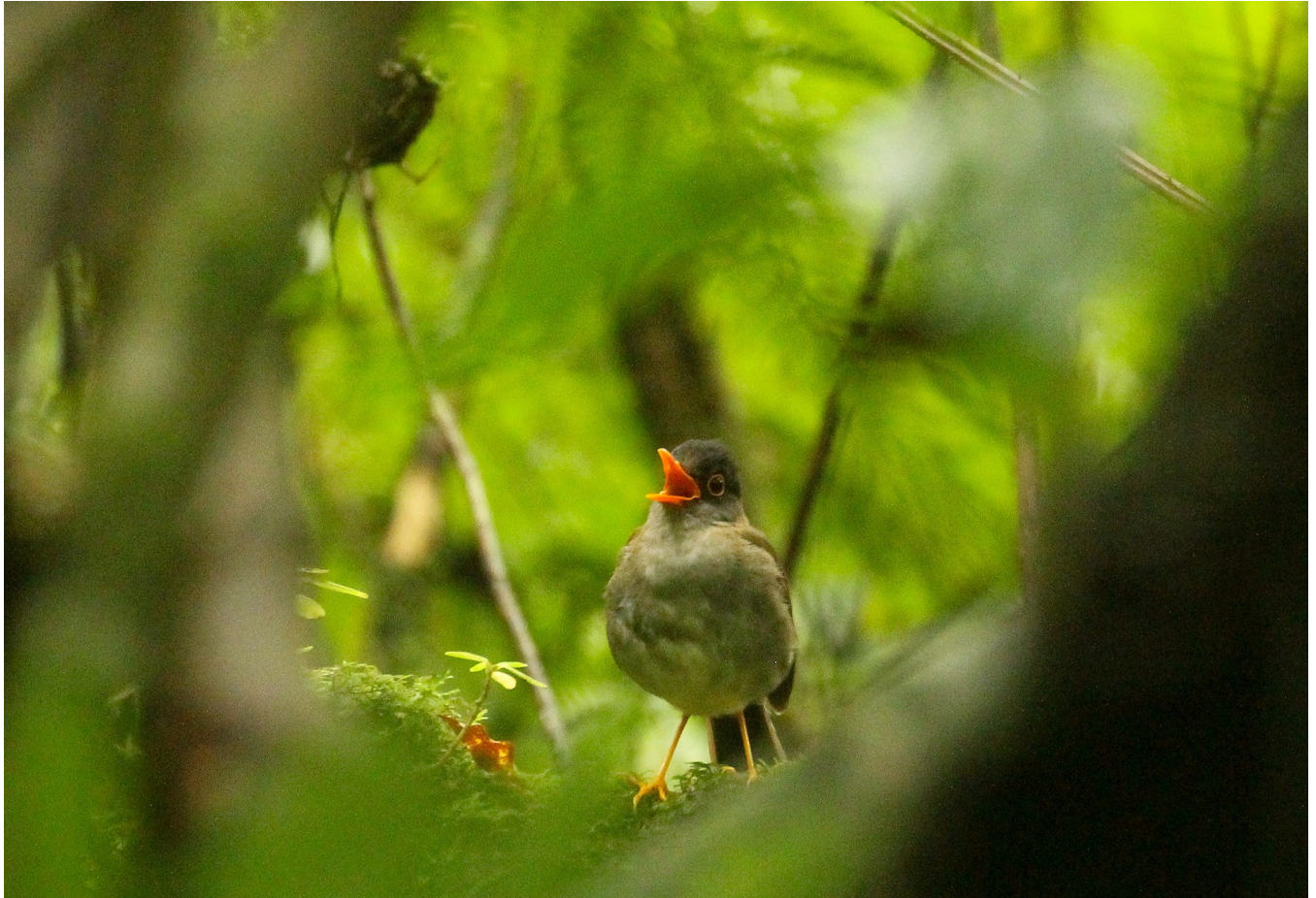
Fig 3. Multiple factors shape the elevational ranges of Black-headed Nightingale-Thrush ( Catharus mexicanus ). While habitat associations appear to drive the elevational distributions of C. mexicanus , the species is also aggressively dominant over its higher elevation congener Ruddy-capped Nightingale-Thrush ( C. frantzii ), displaying the importance of interactions between habitat selection and interspecific competition for elevational ranges [141].

https://doi.org/10.1371/journal.pclm.0000174.g003